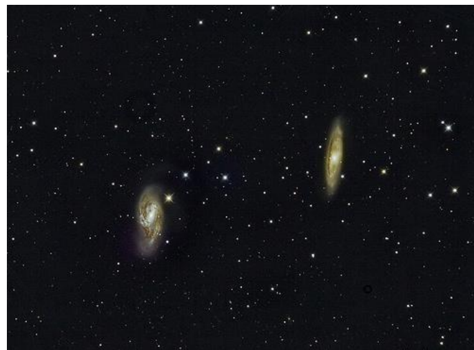
M65 (left) and M66 (right)

Each of the objects in the table below rate at least four stars out of five in The Night Sky Observer's Guide .