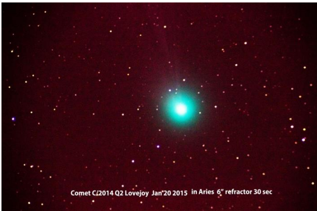
Comet Lovejoy, January 20th 2015

If you get there late, that's ok, just turn off your car lights to save dark adaption. I will be hosting our club Messier Marathon at my observatory in Nibley. If you would like to join me please drop me an email at twestre45@aol.com and I will provide you directions to my place.