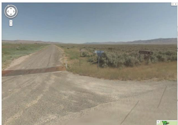
Turn-off (north) into Curlew Campground

The OAS always camps out in the northernmost part of the campground. Make sure that you arrive before dark. There are vault toilets but the water is still shut off this time of year.