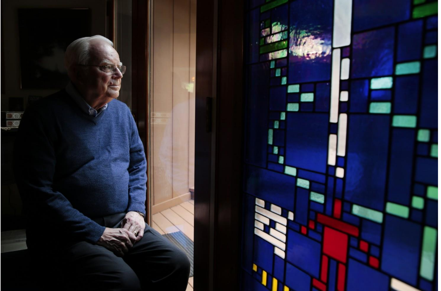
Drake also created the Arecibo Message, a simple binary encoded message broadcast into space by the Arecibo radio telescope in Puerto Rico in 1974. The message encodes several things: the numbers 1 to 10, the basic chemistry of life on Earth, the double helix structure of DNA, Earth's population, a graphic of the solar system, a human figure, and a graphic of the Arecibo radio telescope and its dish's dimensions.

It’s not as complicated as it looks. The number (N) of detectable civilizations is the product of seven factors: The rate of star formation ( R^* ), the fraction of stars with planetary systems ( f_p ), the average number of habitable planets per planetary system ( n_e ), the fraction that actually have life ( f_l ), the fraction that have intelligent life ( f_i ), the fraction with communicative civilizations ( f_c ) and the average longevity of the communicating phase of such civilizations (L).