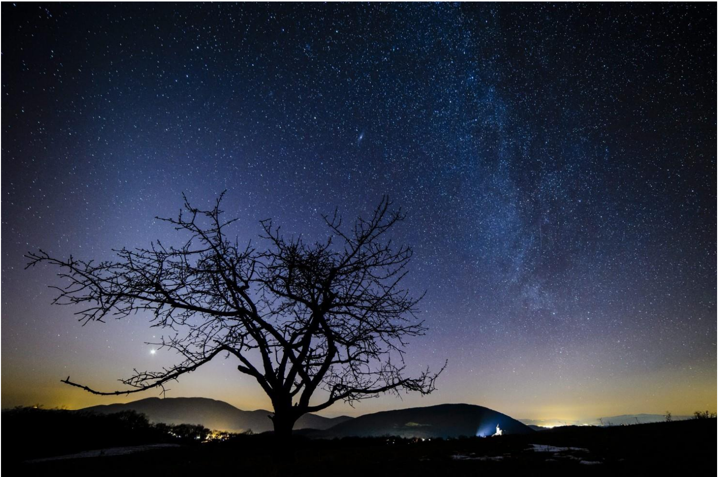
The zodiacal light, left, and the Milky Way, right, are seen from the region of Salgotarjan, northeast of Budapest, on Feb. 17, 2015.

But Brin, a signer of the petition protesting the campaign for active SETI, said we don’t know what’s out there and shouldn’t presume that aliens are benign. He said there are roughly 100 scenarios to explain why we haven’t heard from the aliens so far. Roughly a dozen of those scenarios are unpleasant, he said.