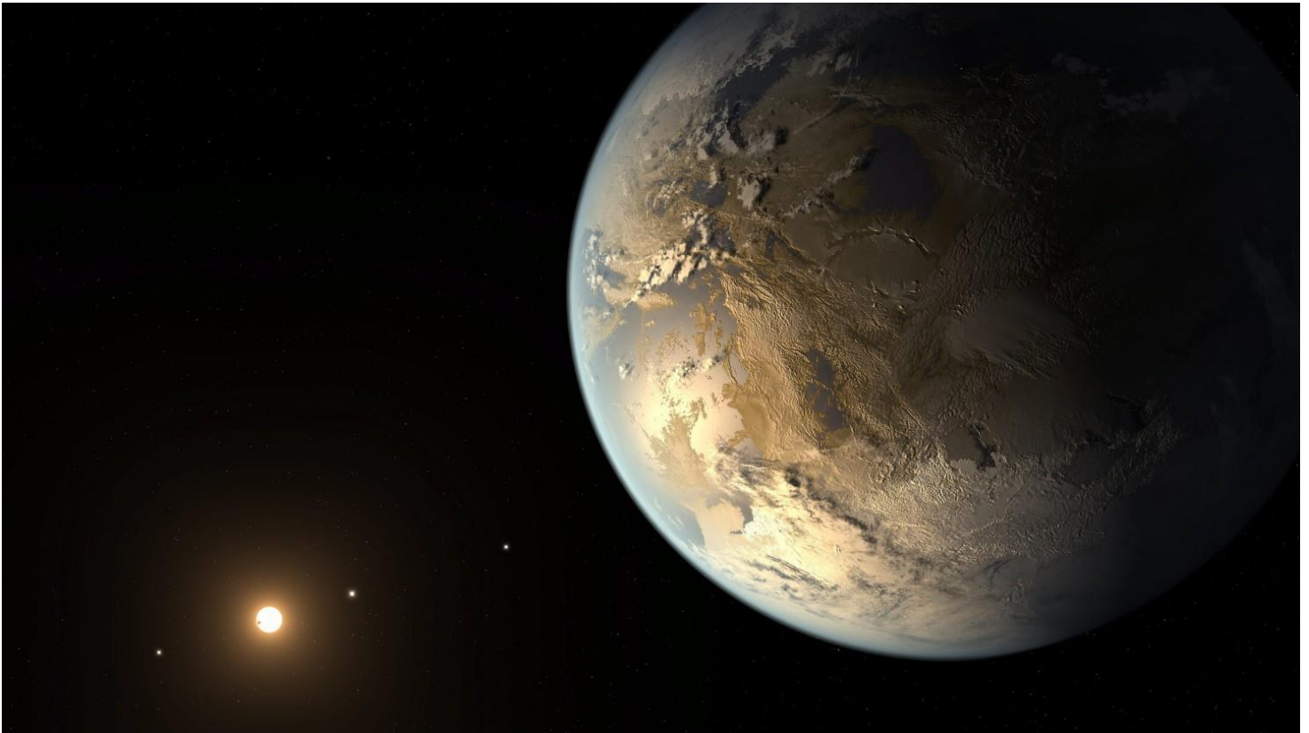
An artist's concept of Kepler-186f, the first validated Earth-size planet to orbit a distant star in the habitable zone, a range of distance from a star where liquid water might pool on a planet's surface. The discovery of Kepler-186f confirms that Earth-size planets exist in the habitable zones of other stars and signals a significant step closer to finding a world similar to Earth.

"ETI's reaction to a message from Earth cannot presently be known," states a petition signed by 28 scientists, researchers and thought leaders, among them SpaceX founder Elon Musk. "We know nothing of ETI's intentions and capabilities, and it is impossible to predict whether ETI will be benign or hostile."